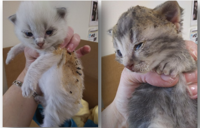
April: Three-week-old kittens Reginald and Sherman were rescued from a burning brush pile with their littermates.

In April, a litter of three-week-old kittens was rescued from a burning brush pile. The smell of smoke entered the exam room before them and lingered long after they left. The Bonfire kittens (Reginald, Abe, Maria and Sherman) were a sorry sight. Smoke had filled their little lungs, fire had seared their fur and whiskers. Poor little Sherman had the worst injuries— one ear tip and most of his whiskers burned off. Staff immediately went to work giving them what they needed—rehydrating fluids, ointment for burns, syringe feedings and a safe, quiet place to heal. Several weeks in foster care, and they are gaining weight and confidence and getting ready to go to their new homes.