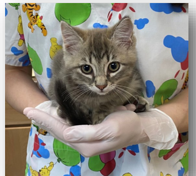
June: Sherman gets a clean bill of health

This year's membership drive will directly support the newly created Sherman General Medical Fund . Named after wee little Sherman, it expands care for sick or injured homeless animals, who aren't covered by the Molly Fund, over 1,200 animals yearly! It will give needed treatment to animals like BoBo.